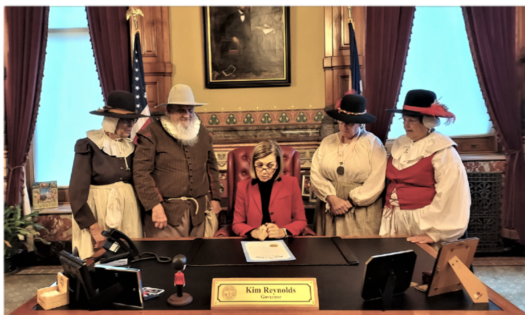
Iowa Mayflower Officers Join Governor Kim Reynolds as she signs a Proclamation declaring Thanksgiving 2021 as the 400th Anniver-

Newsletter of the Iowa Society of Mayflower Descendants